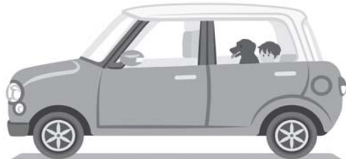
Leaving kids & pets in car. Hot car. Not cool.